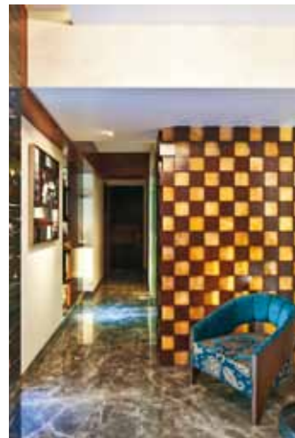
Above: A screen partition made of wood and honey-onyx blocks divides the waiting area and the prayer room. The passage leads to the son's bedroom.