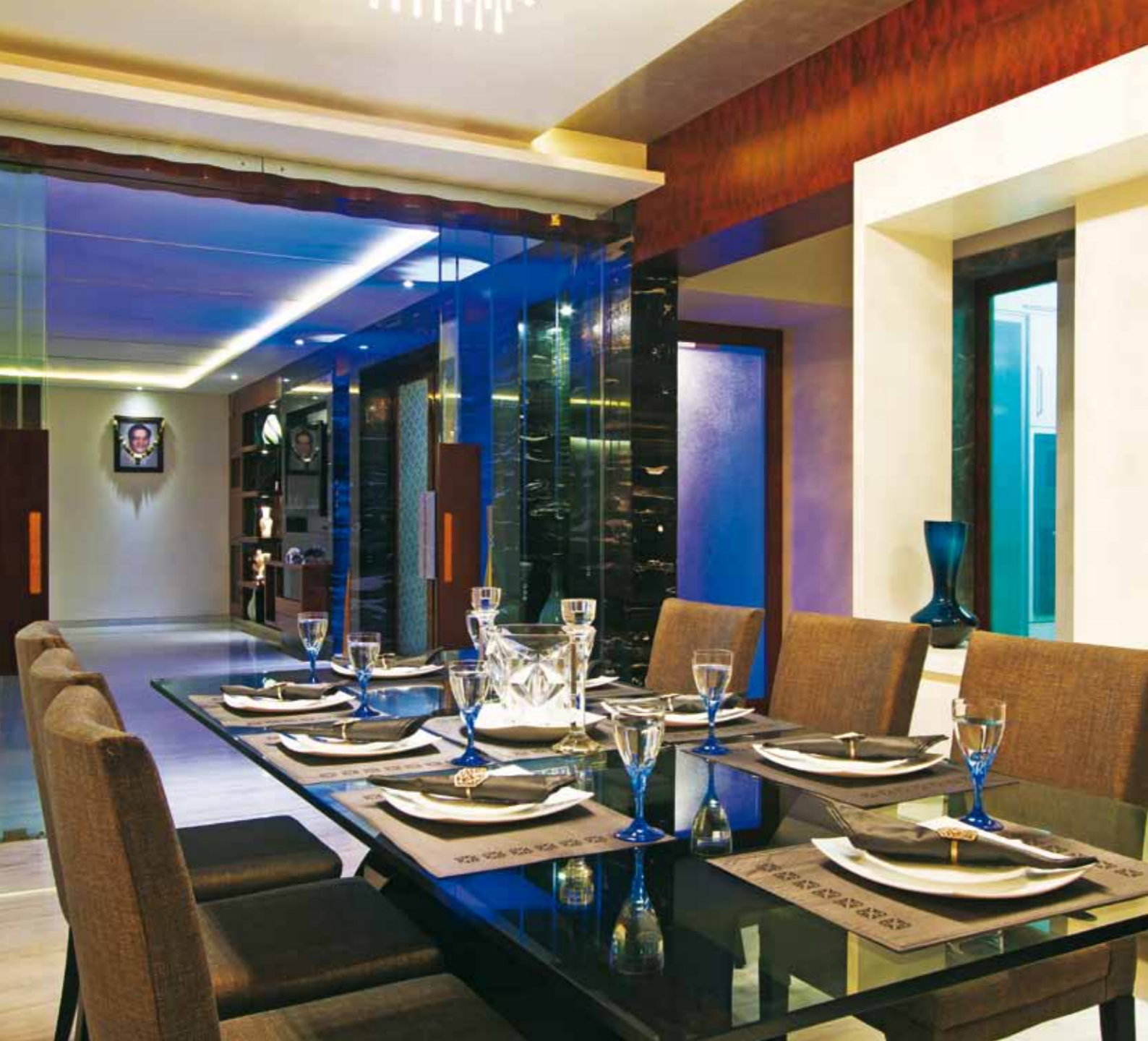
Above: Sliding glass doors separate the living from the dining. The walls in the dining area are accentuated with a sculpture and a painting on opposite walls. The sculpture has been procured from Ego Furniture Lounge, Mumbai.

entertainment room, a dining and a living area, kitchen, servant's quarter and a prayer room.