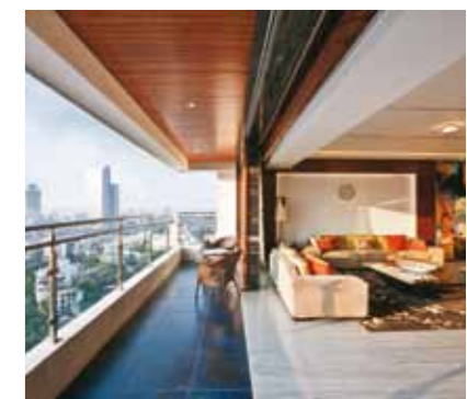
These pages: A 30 ft long balcony is separated from the living room through sliding glass doors that adds volume to the living room. Wooden grooved panels on the ceiling and dark flooring distinguish the balcony from the living.